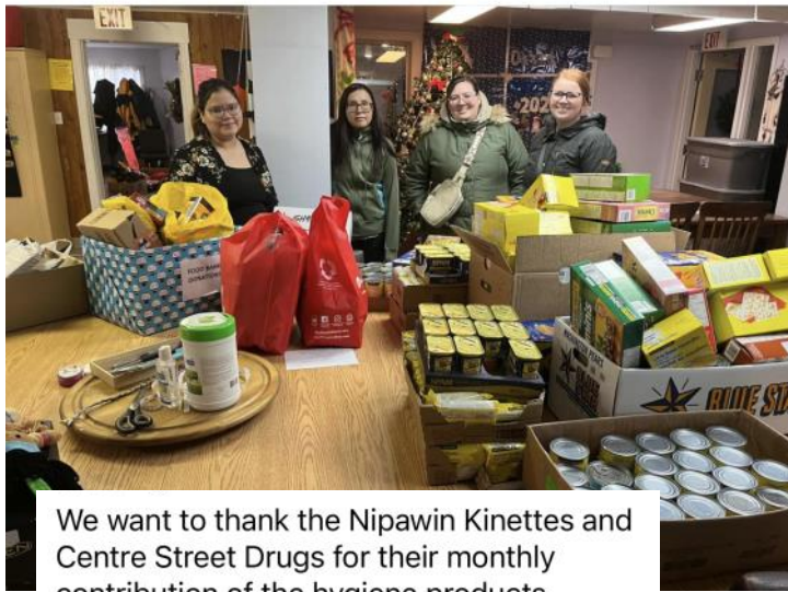
We want to thank the Nipawin Kinettes and Centre Street Drugs for their monthly contribution of the hygiene products. Much appreciated! Thankyou for thinking of us 😊